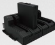
4-bay Battery Charger