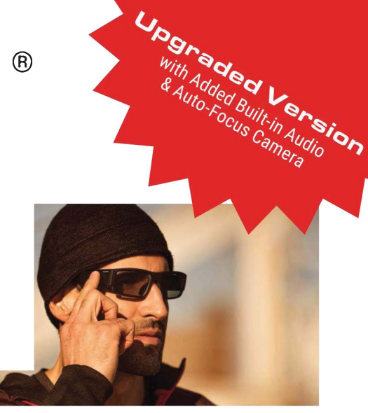
Receive work instructions on the job