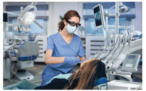
Real-time, hands-free information