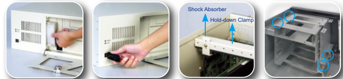
Replaceable fan filter