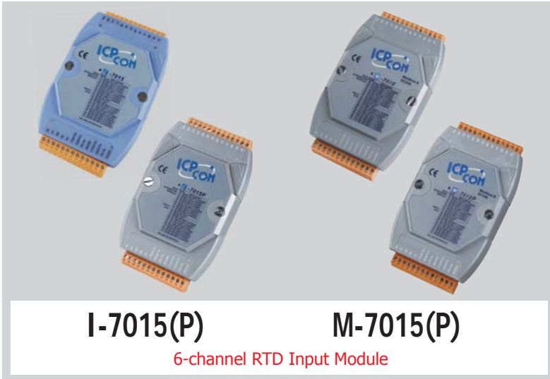
I-7015(P) M-7015(P) 6-channel RTD Input Module