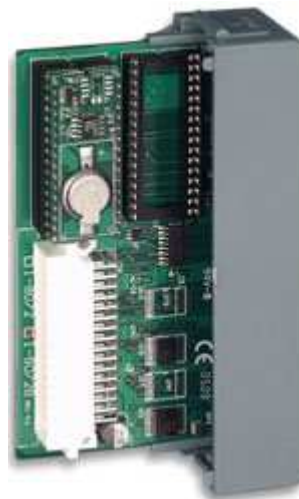
I-8072 with S256/512