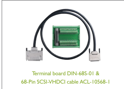
Terminal board DIN-68S-01 & 68-Pin SCSI-VHDCI cable ACL-10568-I