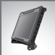
A140 with Multi-Function Hard Handle as Kickstand